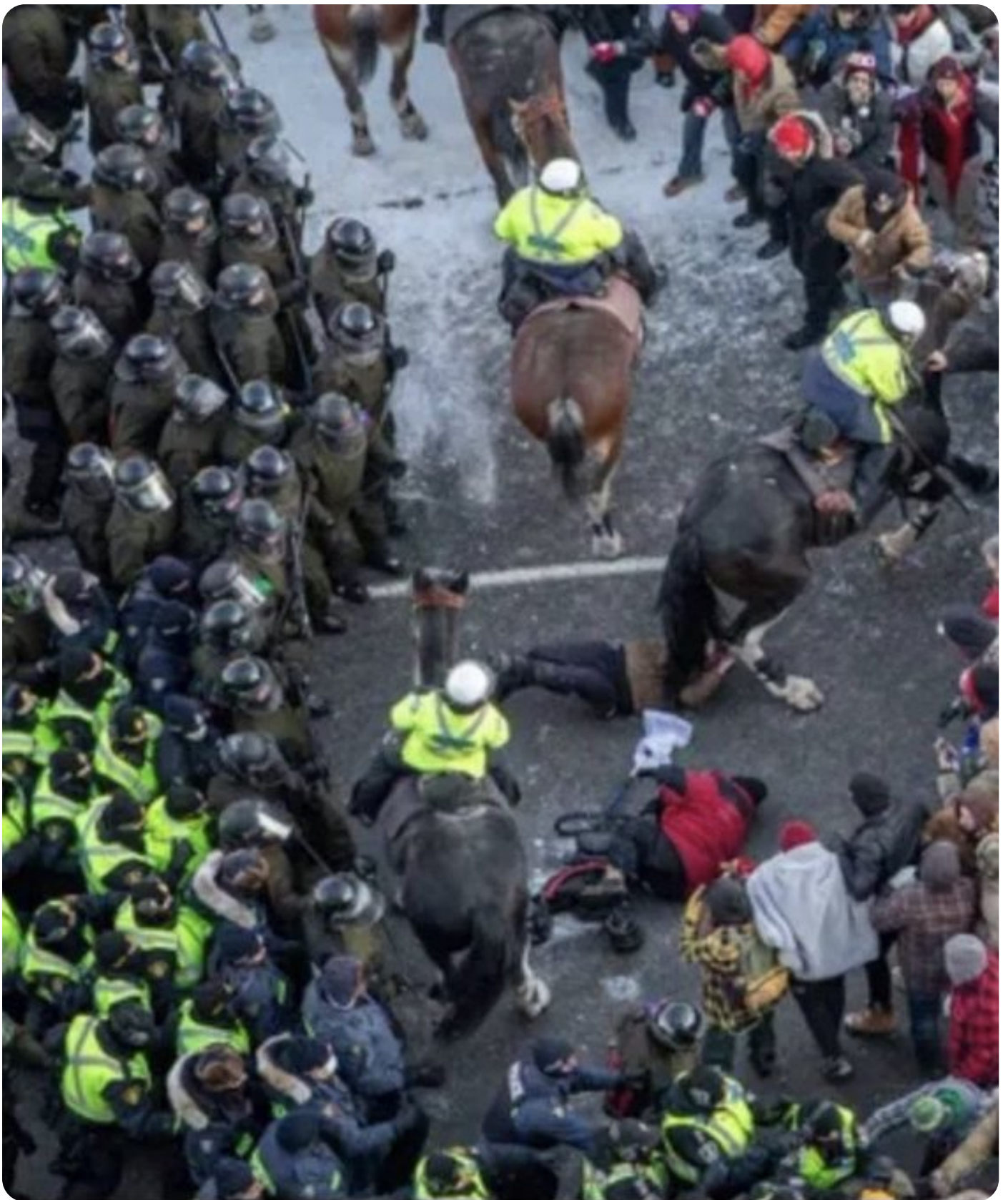
658. lady trampled by horse