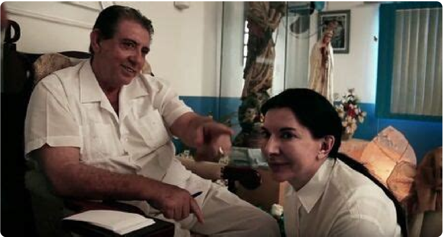
37. Abramovic has even done a spirit cooking art cabin in Japan #abramovic #japan