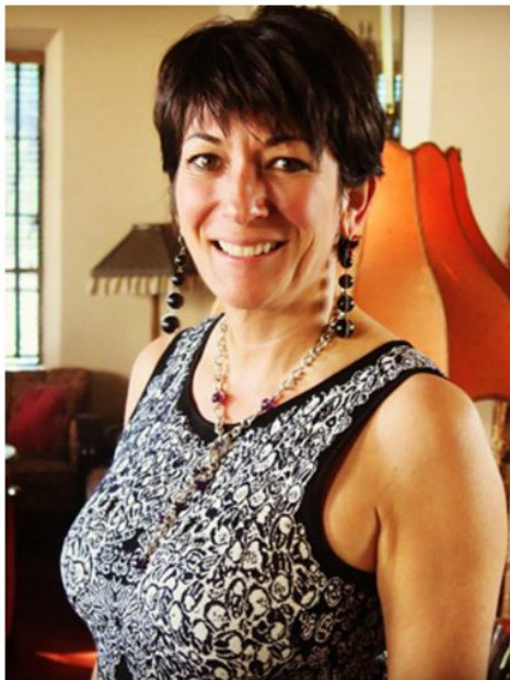
Ghislaine Maxwell at the Chateau Marmont in Los Angeles for a lunch in honor of the performance artist Marina Abramovic.

38. Ghislaine Maxwell child trafficker and child abuser was at the infamous Chateau Marmont for a Dinner for Abramovic... #Ghislaine #Maxwell #Abramovic #ChateauMarmont