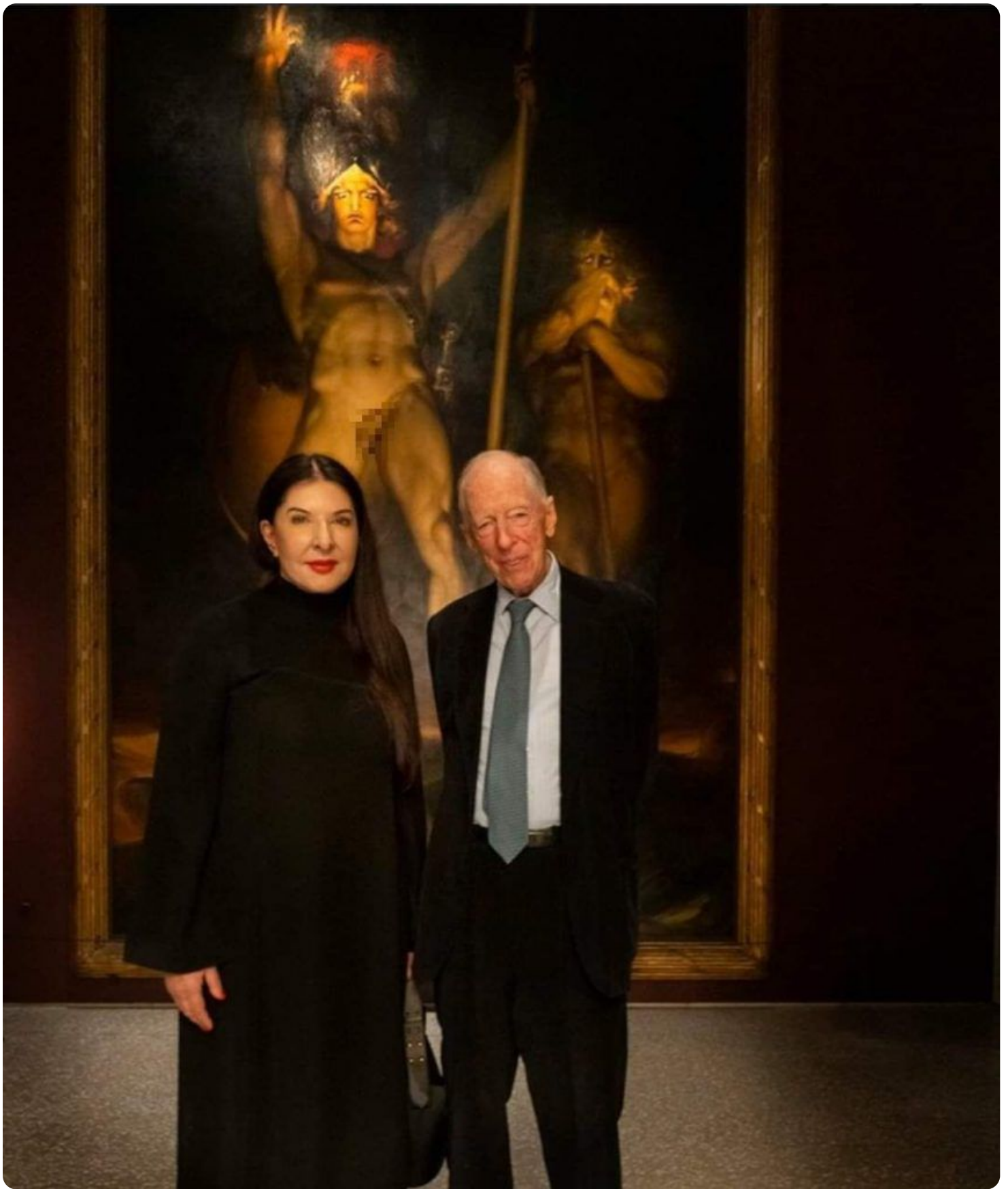
19. Abramovic's work is full of body parts and satanic symbolism... #MarinaAbramovic #satanic #luciferian