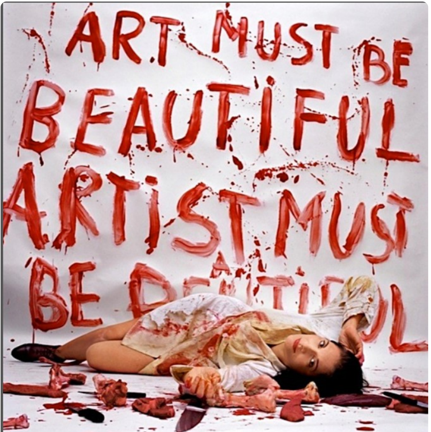
"Art Must Be Beautiful, Artist Must Be Beautiful." Photo commemorating Abramović's 1975 performance piece of the same name.

https://art-for-a-change.com/blog/2017/05/spirit-cooking-with-marina-abramovic-the-first-cut-is-the-deepest.html