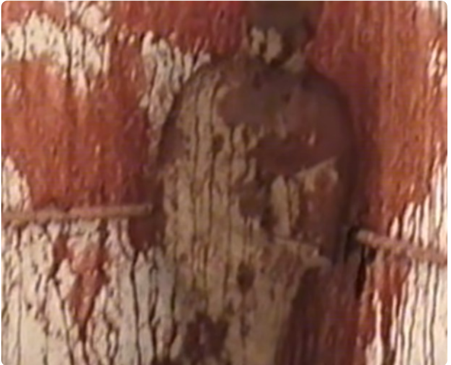
3. She wrote on walls in pigs blood - Mix fresh breast milk with fresh sperm milk. Drink on earthquake nights #MarinaAbramovic #spiritcooking